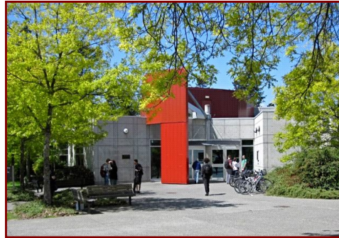
The Harry Hickman Building

Learning and Teaching Centre Harry Hickman Building, Room 126 The University of Victoria Phone: 250-721-8571 Fax: 250-721-6494 Email: ltc@uvic.ca