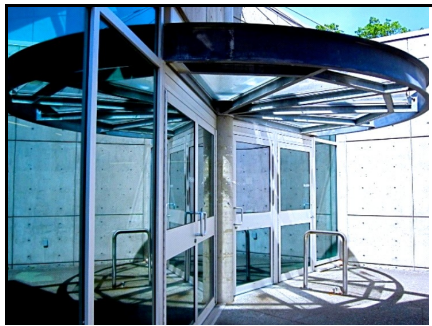
Reflections on the door of the Harry Hickman Building

There are no prerequisites. However, we do recommend that applicants have some background knowledge through a Teaching Assistantship or other teaching experience.